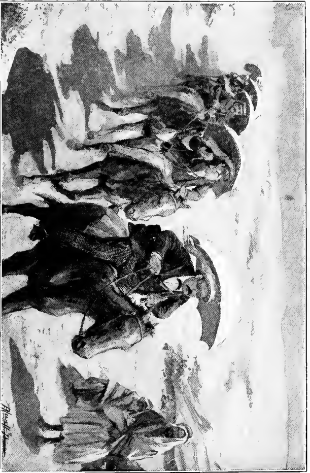
OUR PARTY OF EIGHT